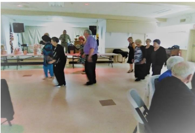
Attendees at the East Bay Charity Ball on November 4 th

Other activities help unite us to others in service to our community, such as the Nativity Lighting at the RI State House